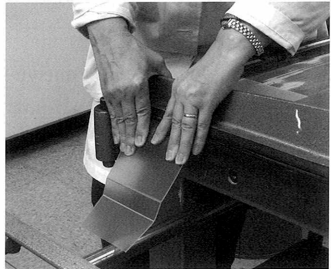
Fig. 3. . . . and bend it back and forth until pliable.

Record folds to be made according to book opening. (For more on basic cradle making, see Linda Blaser's 1992 article.) The sheet is cut slightly shorter than the height of the book to be cradled, making sure that the grain of the sheet runs from head to tail of the book, to facilitate the bending procedure. The sheet is then placed into the board cutter, using a ruler to measure the first bend (fig. 2). Clamp down and bend the Vivak 099 back and forth until the material becomes pliable (fig. 3). This process is repeated for every fold to be made, by sliding the sheet under the board cutter's clamp to the next measured fold. To achieve