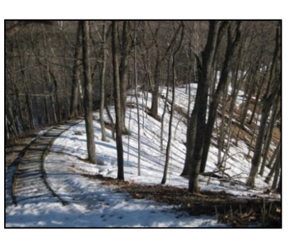
Stop #5 Esker