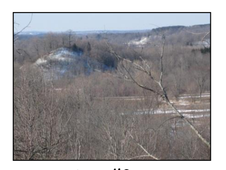
Stop #2 Kames, Moraines, Outwash Plains