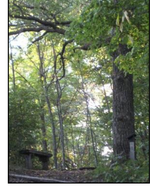
Stop #4 Summit