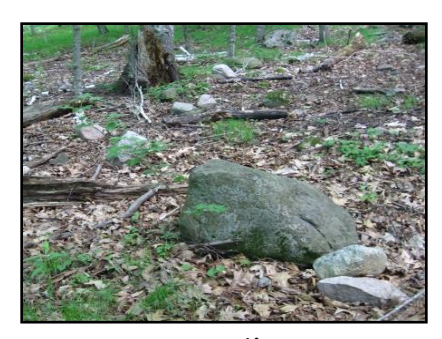
Stop #6 Erratics