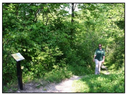
Stop #8 Finish