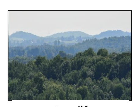
Stop #3 Drumlins, Long Lake