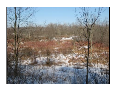
Stop #7 Kettles