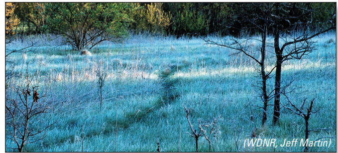
Figure 3-1: A deer trail meanders through a frost-covered forest opening. The retention of openings, created during forest operations, can help provide a mix of habitat conditions for many wildlife species. Other species, including some that are rare, rely mostly on unbroken, contiguous forest.

Certainly, more can be done to enhance wildlife habitat or individual species than the steps recommended in these guidelines. Furthermore, each management