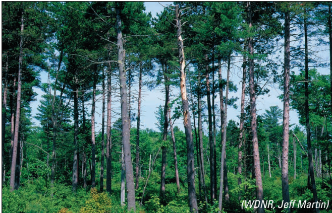
Figure 3-3: This strip of uncut pine provides a wildlife travel corridor through a clearcut area.

Cavity/snag trees are equally important in forested stands. There are a number of cavity-dependent species that require a larger forested acreage with sufficient canopy cover. Small mammals, bats and breeding birds that live in heavily forested areas also nest in cavities and use snags for foraging sites. Black-capped chickadees and tufted titmice are only two of a number of charismatic forest bird species that nest in cavities. When conducting an uneven-aged harvest or even-aged thinning it is recommended to retain snag and cavity trees (see Appendix A: Tree Marking and Retention Guidelines). Barred owls and pileated woodpeckers utilize large cavities and snag trees, while downy woodpeckers and chickadees utilize smaller trees. In addition to serving as nesting and foraging sites, these trees will also eventually topple and contribute to coarse woody debris on the forest floor, providing cover, food and growing sites for many species.