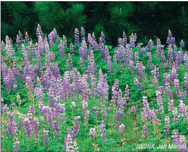
Figure 3-12: Wild lupine in central Wisconsin; the Karner blue butterfly's only known larval food plant. The Karner blue is listed as an endangered species, even though they are relatively abundant in parts of Wisconsin.

Forest streams come in many sizes, growing from spring-fed trickles to large rivers as they move downhill, and converge with one another to drain larger and larger watersheds. Along this gradient, the ecological characteristics of a riparian area change in a gradual continuum. Because of these characteristics, management guidelines for riparian areas in general should be considered on a landscape level.