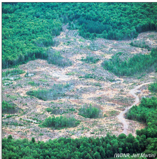
Figure 3-10: Numerous “islands” of uncut trees in this clearcut stand, along with scalloped edges, provide good wildlife habitat and improved visual impact after timber harvesting.