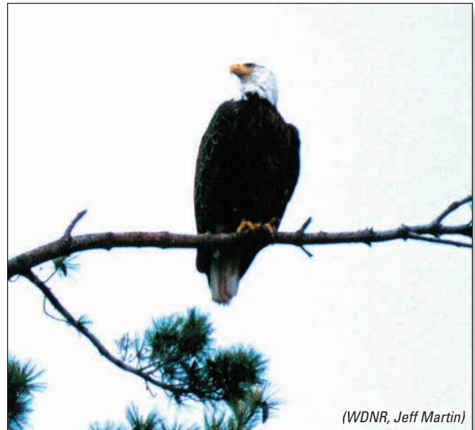
Figure 3-9: A bald eagle resting on a white pine branch in northern Wisconsin.