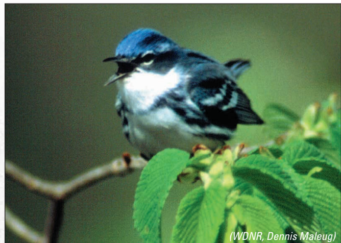
Figure 3-13: Large blocks of older forest are important to forest interior species such as this cerulean warbler.