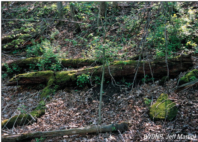
Figure 3-5: Coarse woody debris provides cover, food, habitat structure, and growing sites for many different animals and plants.

Woody detritus, like branches, twigs and leaves, reduces erosion and affects soil development, stores nutrients and water, is a major source of energy and nutrients, serves as a seedbed for plants, and is a major habitat for microbes, invertebrates and vertebrates. For example, yellow birch, white cedar and eastern hemlock regeneration is enhanced by woody debris. These tree species are important components of a diverse northern forest, and provide habitat for an untold number of vertebrate and invertebrate species. Bird researchers in northern Wisconsin found that hemlock dominated natural areas contained higher species diversity and richness than the even-aged managed hardwood sites that dominate much of the north.